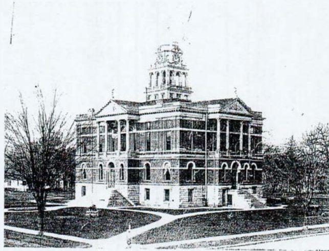
EATON COUNTY COURT HOUSE, CHARLOTTE, MICHIGAN

PUBLISHED BY WILMER ATKINSON COMPANY PUBLISHERS OF THE FARM JOURNAL WASHINGTON SQUARE, PHILADELPHIA