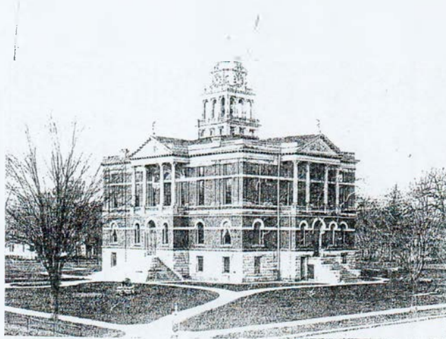
EATON COUNTY COURT HOUSE, CHARLOTTE, MICHIGAN

PUBLISHED BY WILMER ATKINSON COMPANY PUBLISHERS OF THE FARM JOURNAL WASHINGTON SQUARE, PHILADELPHIA